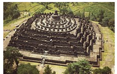
Aerial view of Borobudur

The plan of the Borobudur temple complex in Java mirrors the three main levels of Buddhist cosmology. The highest point in the center symbolizes Buddhahood.